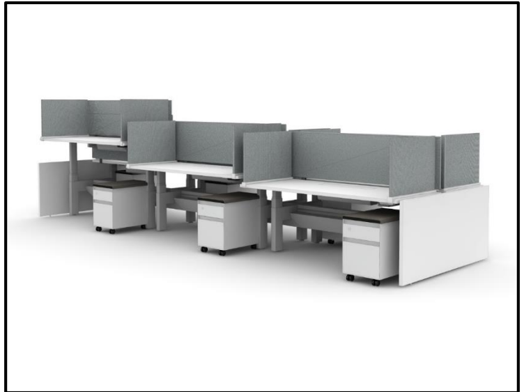
Side + Details Screen