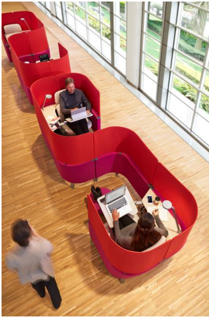
Steelcase Brody Worklounge