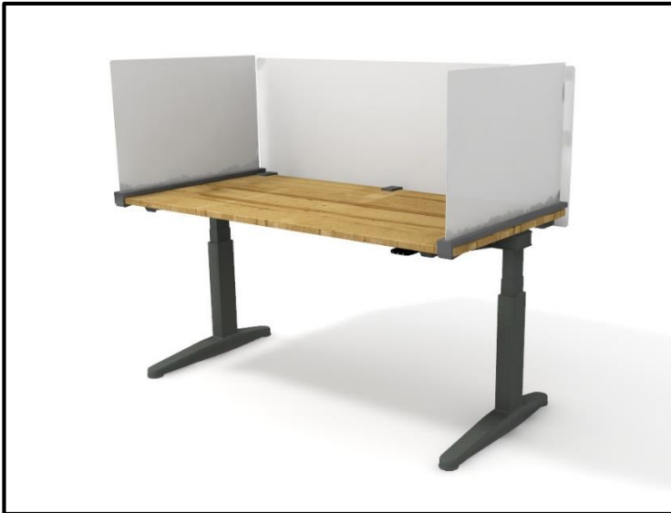
Side + Details Screen