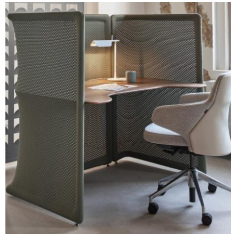
Coalesse Focus Nook (above) Steelcase Sylvi Lounge (left)