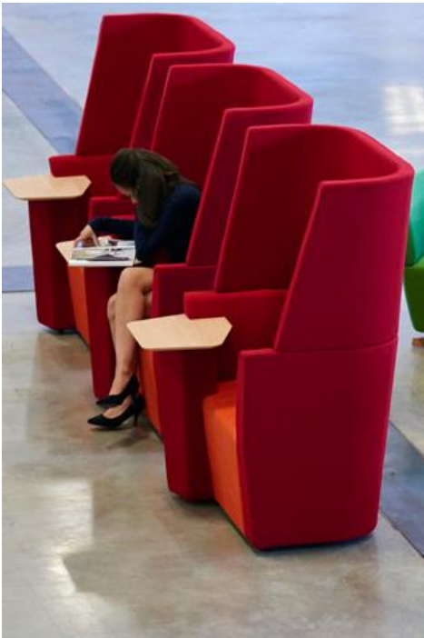
OrangeBox Away from the Desk