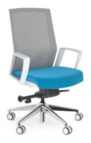
Fixed Loop Arms