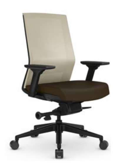
3-way Adjustable Arms