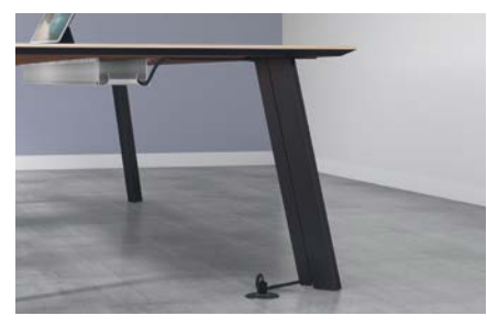
MAKE A POWER PLAY

Power is easy to access with flip-top and built in ports. Optional wireless charging is an added bonus.